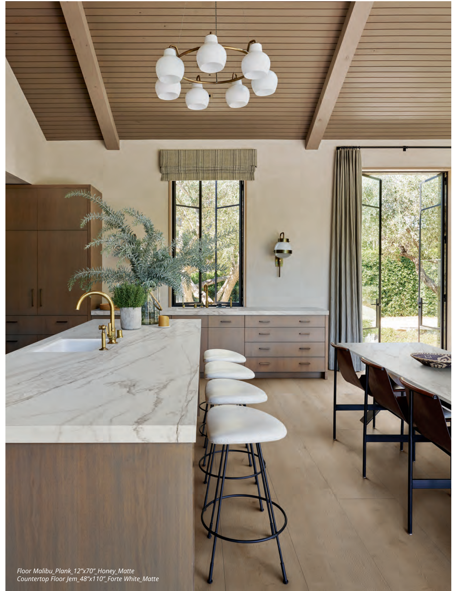
Floor Malibu_Plank_12"x70"_Honey_Matte Countertop Floor Jem_48"x110"_Forte White_Matte