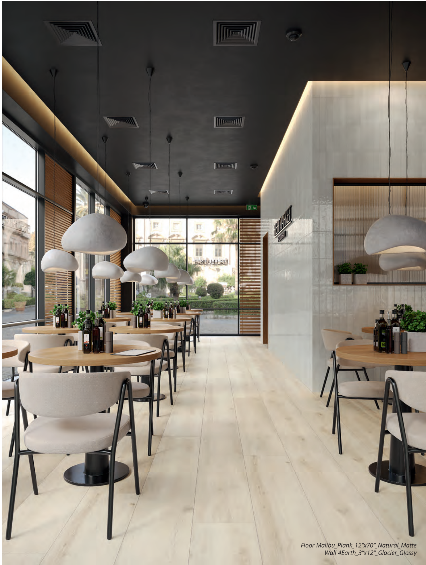
Floor Malibu_Plank_12"x70"_Natural_Matte Wall 4Earth_3"x12"_Glacier_Glossy