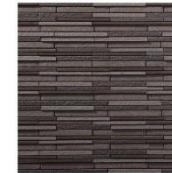
HAL-R/LNS-4 Dark Brown