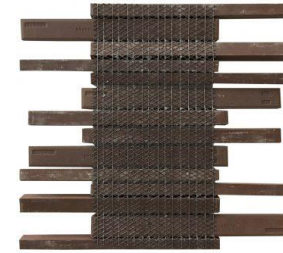
Mounting : Back net