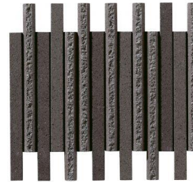
Dimension of Sheet