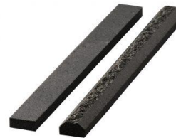
Dimension of piece ( 2 type mix )