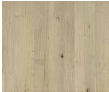
OPULENT OAK RE6HALO