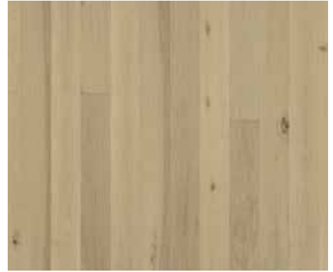
GRAND HICKORY RE6KETH