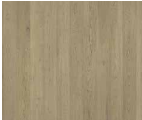
PALATIAL HICKORY RE6STAH