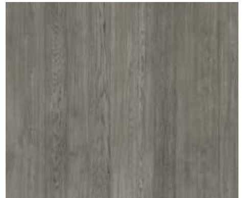
DELUXE HICKORY RE6WINH