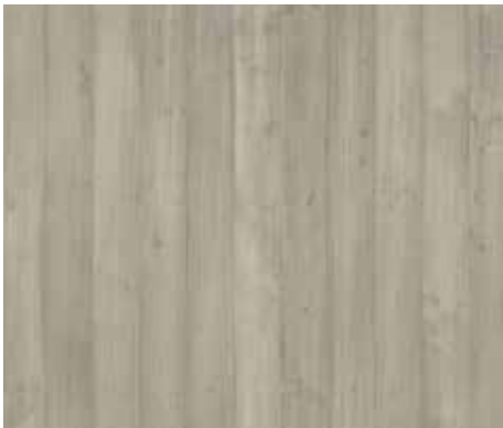
RITSY MAPLE RE6SAIM