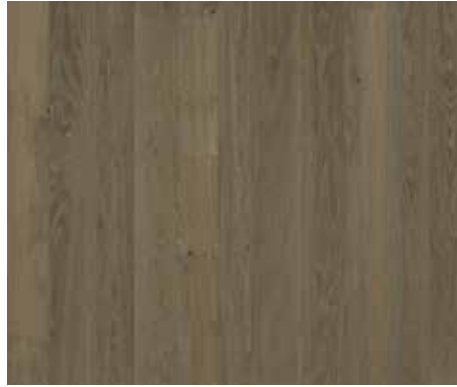
MAGESTIC OAK RE6ANCO