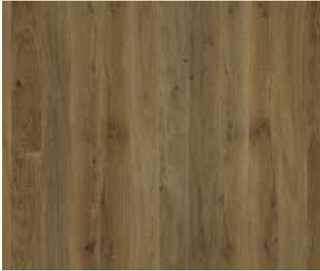
EXALTED OAK RE6LEEO