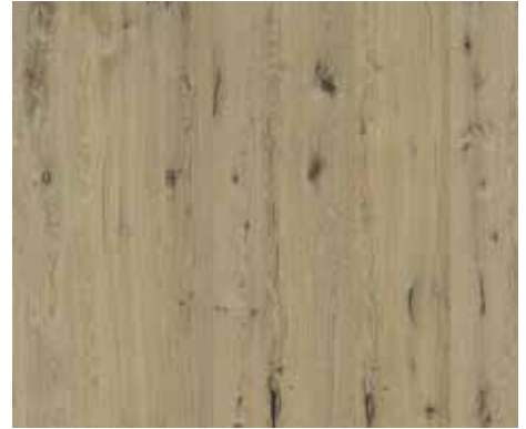
LAVISH OAK RE6SPIO