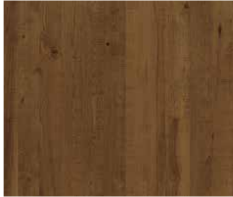
FINE HICKORY RE6PORH