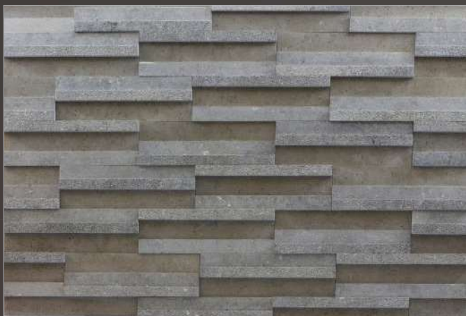
Terra Dimensional Tile™ (P. 12, 33)

Fresh and on-trend, our Portugal Collection comes in sets of three modern patterns. Whether you're looking for a flat-finish, or a dimensional surface, this collection allows you to tap into your inner artist and design something that is truly one-of-a-kind. For a complete solution of striking, natural stone applications, pair it with coordinating molding and trim pieces.