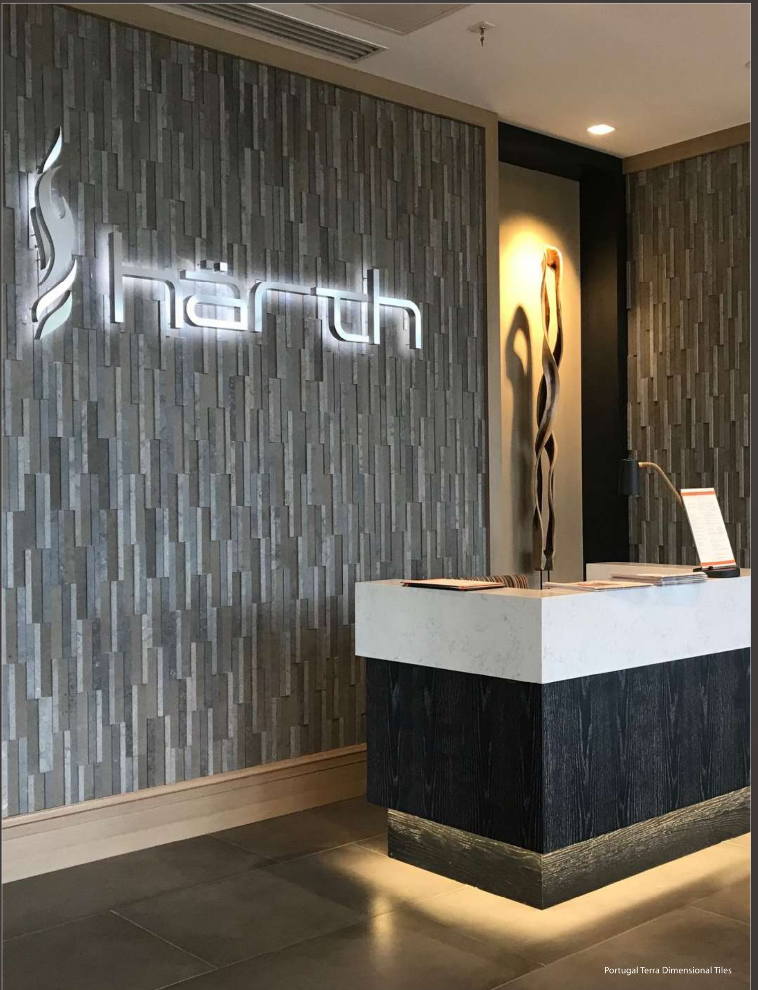
Portugal Terra Dimensional Tiles