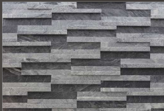
Cinza Dimensional Tile™