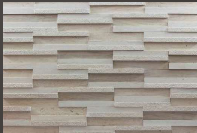
Areia Dimensional Tile™