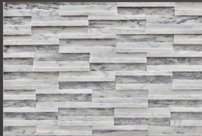
Venato Dimensional Tile™