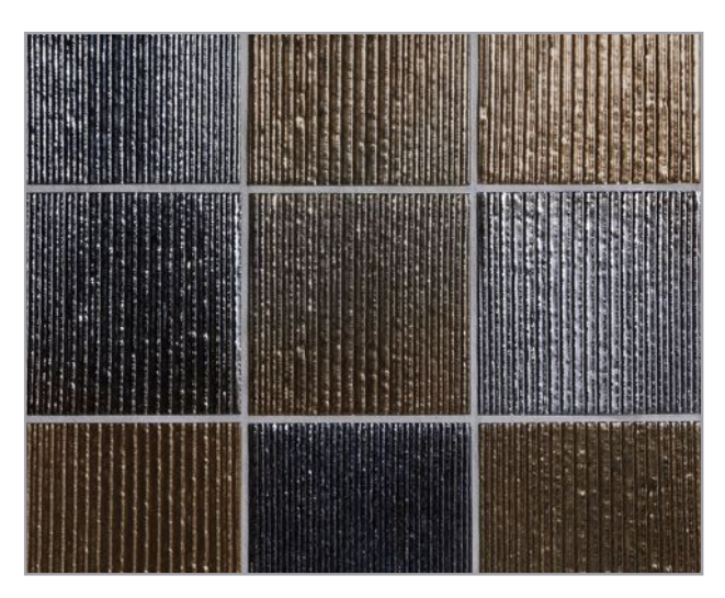
Tide (4 x 4)