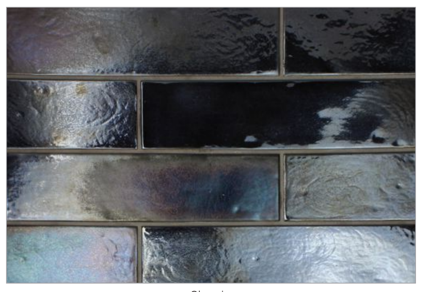
\label{eq:olympia} \textbf{Glaze contains multiple color variations between pieces. Visit LunadaBayTile.com for more images.}