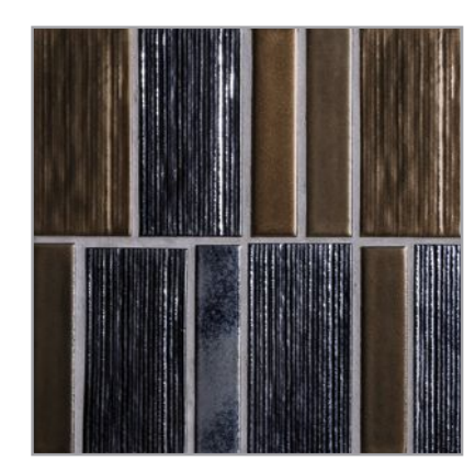
Swell Mosaic (¾ x 3 ¾, 1 % x 3 ¾)