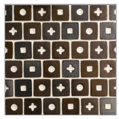
Silhouette Mosaic (1 ½ x 1 ½) Not available in the color Olympia.