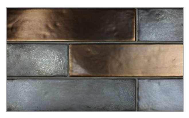
Smooth (2 ½ x 9 ½)