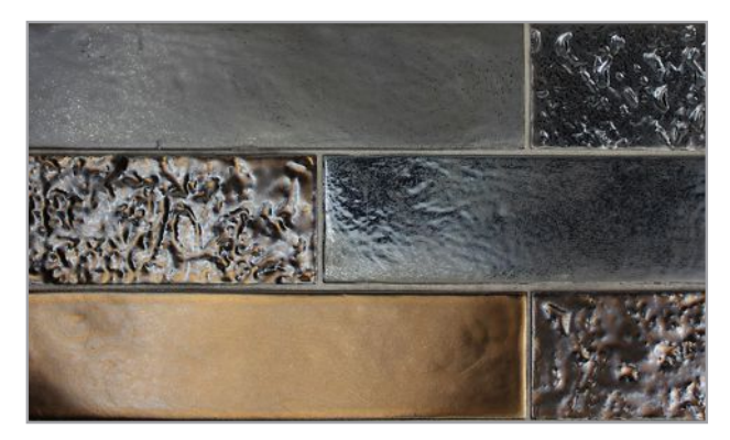
Reef (2 \% \times 9 \%) Equal blend of smooth and textured surfaces.