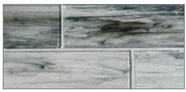
2 x 6 Brick