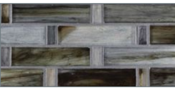
Tresse (\frac{1}{2} \times 1 \& 1 \times 4)