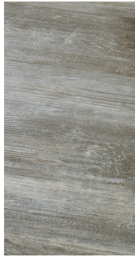
KEELE 6" x 48"