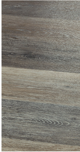
KENT 6" x 36"