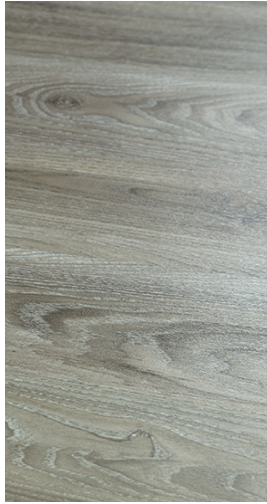
BRUNEL 6" x 36"