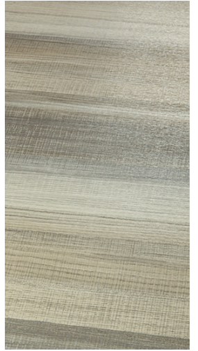
ASTON 6" x 48"