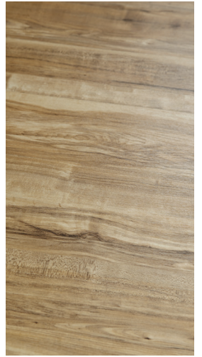
NOTTINGHAM 6" x 36"