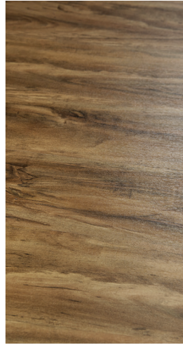
NEW CASTLE 6" x 36"