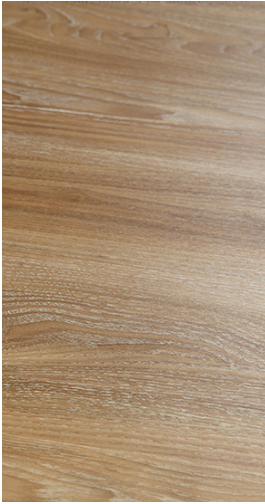
LEEDS 6" x 36"