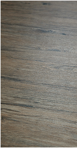
LANCASTER 6" x 36"