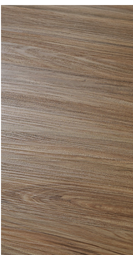
CHESTER 6" x 48"