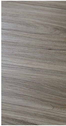
SALFORD 6" x 48"