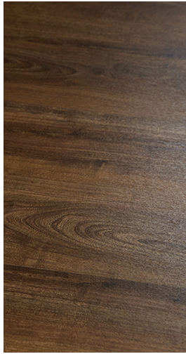
OXFORD 6" x 36"