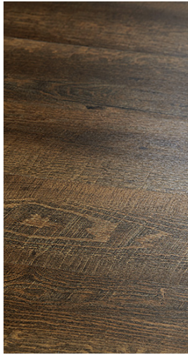
YORK OAK 6" x 36"