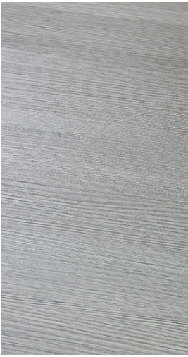
LINCOLN 6" x 48"