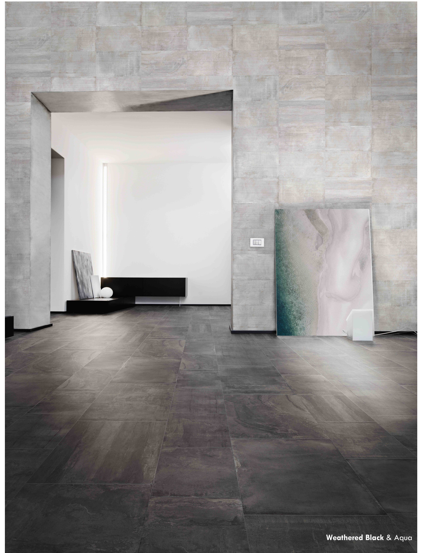
Weathered Black & Aqua