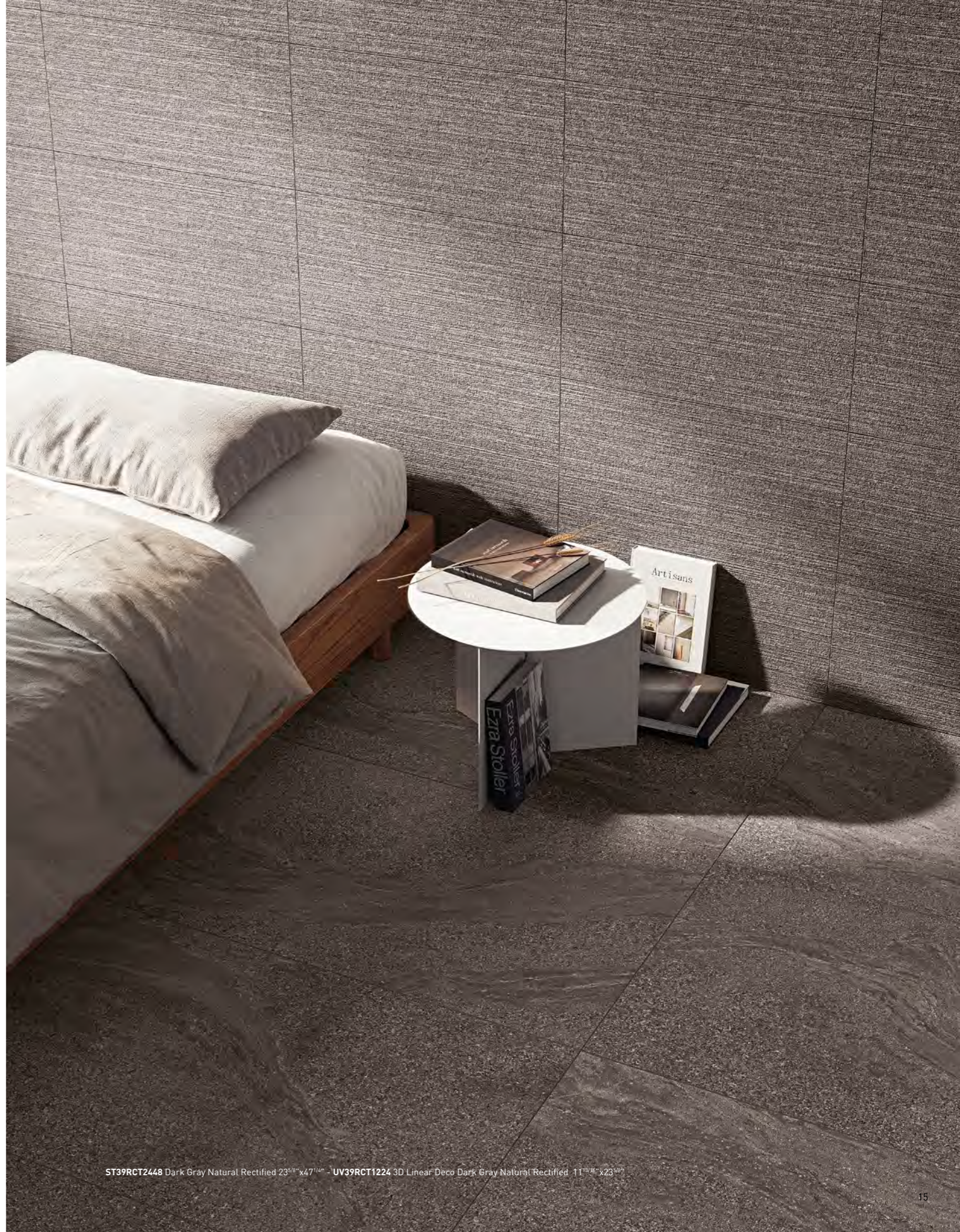
ST39RCT2448 Dark Gray Natural Rectified 23 5/8 " x 47 1/4 " - UV39RCT1224 3D Linear Deco Dark Gray Natural Rectified 11 3/8 " x 23 5/8 "

dynamic textures profoundly connected with our origins