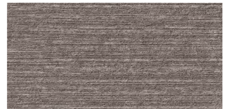
ST39RCT1224DCMT 11 13/16 "x23 5/8 " 3D Linear Deco Dark Gray Nat Rectified