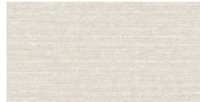
ST36RCT1224DCMT 11 13/16 "x23 5/8 " 3D Linear Deco White Nat Rectified