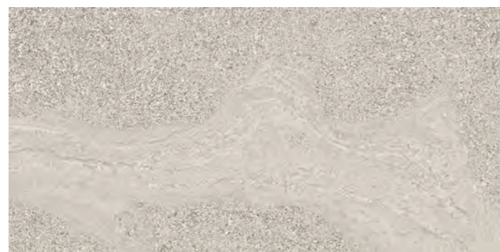
ST38RCT2448MT 23 5/8 "x47 1/4 " Light Gray Nat Rectified ST38RCT1224MT 11 13/16 "x23 5/8 " Light Gray Nat Rectified