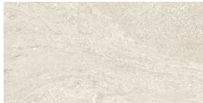
ST36RCT2448MT 23 5/8 "x47 1/4 " White Nat Rectified ST36RCT1224MT 11 13/16 "x23 5/8 " White Nat Rectified