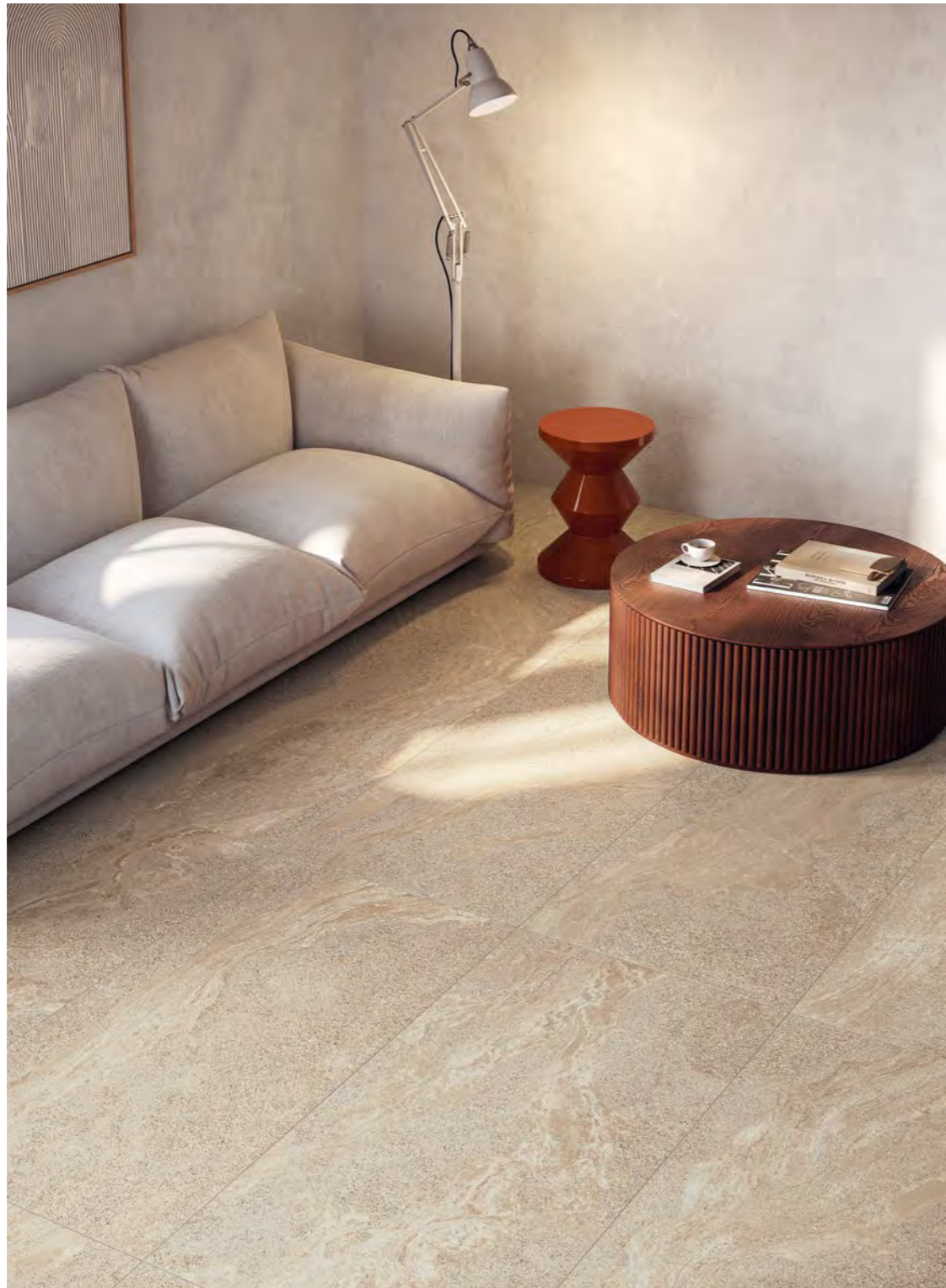
ST37RCT2448 Beige Natural Rectified 23 5/8 " x 47 1/4 "

dynamic textures profoundly connected with our origins