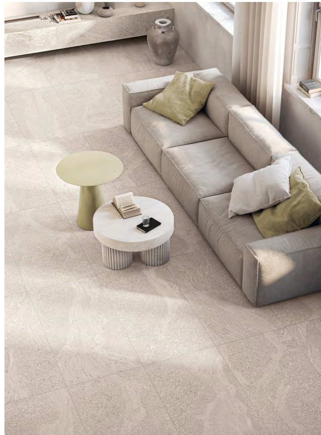
ST36RCT2448 White Natural Rectified 23 5/8 " x 47 1/4 "

open dialogues between form and matter for a natural style