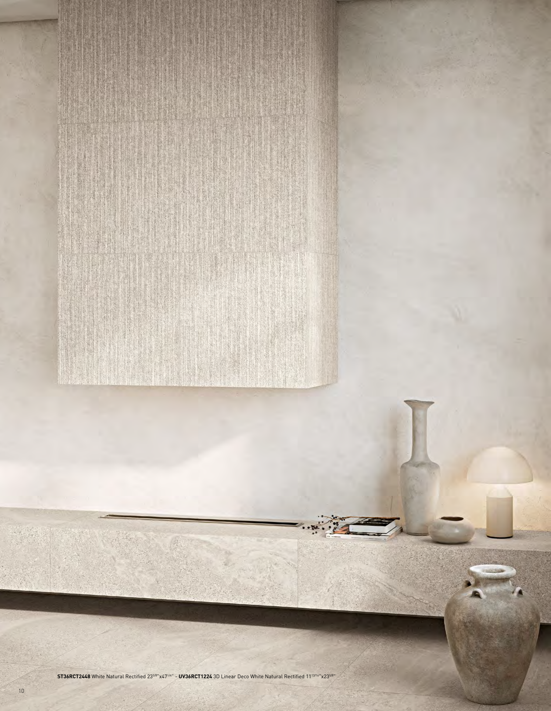
ST36RCT2448 White Natural Rectified 23 5/8 " x 47 1/4 " - UV36RCT1224 3D Linear Deco White Natural Rectified 11 13/16 " x 23 5/8 "