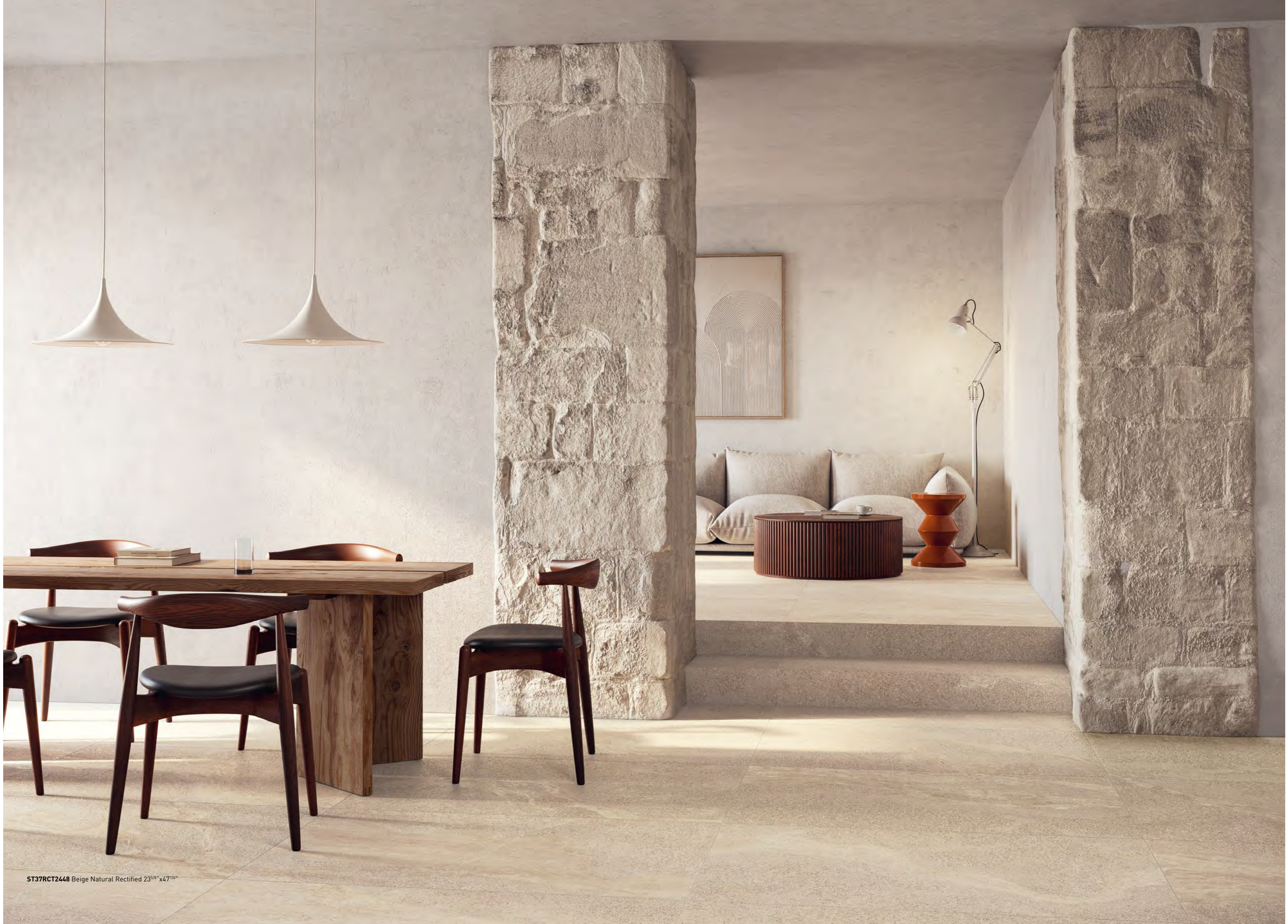
ST37RCT2448 Beige Natural Rectified 23 5/8 " x 47 1/4 "