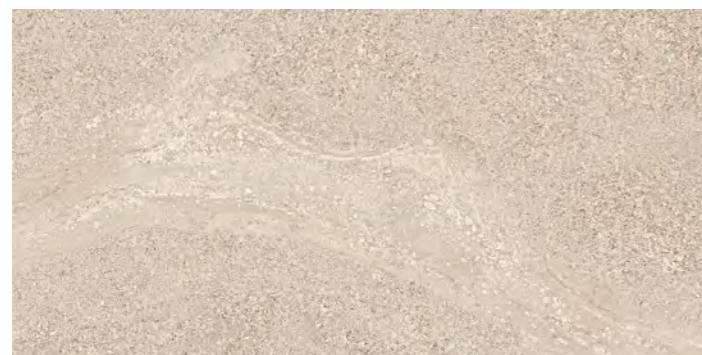
ST37RCT2448MT 23 5/8 "x47 1/4 " Beige Nat Rectified ST37RCT1224MT 11 13/16 "x23 5/8 " Beige Nat Rectified