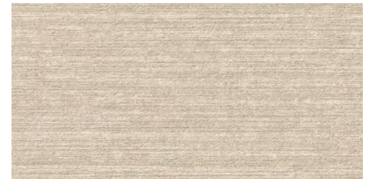
ST37RCT1224DCMT 11 13/16 "x23 5/8 " 3D Linear Deco Beige Nat Rectified