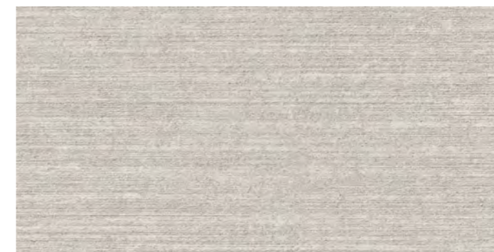
ST38RCT1224DCMT 11 13/16 "x23 5/8 " 3D Linear Deco Light Gray Nat Rectified