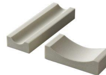
Dimension of piece ( 2 type mix )