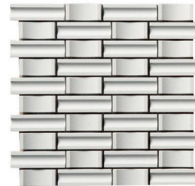
Dimension of Sheet

Gray net may be visible from between joints. Colors may vary even within the same batch. Joint widths may vary even within a sheet.